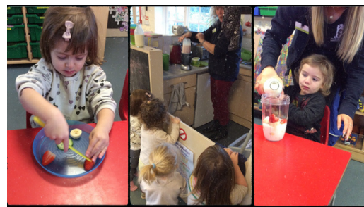
Willows room children enjoying making their own smoothies

The children have also had a chance to try longevity noodles. They started off looking at and feeling some of the ingredients. The children said the noodles were hard and that we needed to cook them to make them soft. We also looked at chives and mushrooms. We cooked the noodles, and stir-fried the vegetables in oyster and soy sauce, before mixing in the noodles. All the children were very keen to try them and have a go at using chopsticks.